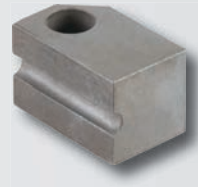
Swivel Clamp may be used with Style B Grooved Collar

Used with Clevis Clamp or Swivel Clamp for tube bending. (Does not require Quik-Lok Clamp Assembly.)